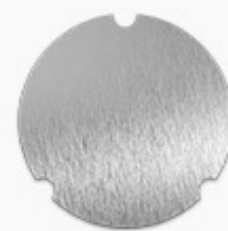
Metal Plate for Ceiling/Wall Mount

The C2C comes with a magnetic base and mounting kit for easy placement on walls or ceilings. Once set up, you can manually adjust it to cover just about any angle you need.