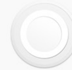
Anti-Slip Silicone Ring Base